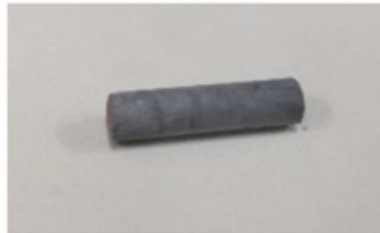
Figure 1: Sample of magnetic composite.

The matrices prepared in alkaline conditions and the one in acidic ones will allow the investigation of the electrical properties, which are known to depend strongly on the activation conditions due to the different ionic content.