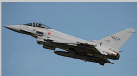
EFA (European Fighter Aircraft)

This work was carried out as part of a project supported by: UNIFRONT Spin-off of the University of Padua.